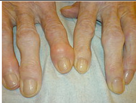
Heberden's nodes are hard bony enlargements in the fingers which may form with OA. They are not necessarily painful, but do limit movement of the fingers. 6

OA can affect the hands, feet, hips, knees, neck and spine. 1,2 OA of the feet and hands may have genetic origin, with numerous female members of one family developing it. 2